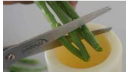
Figure 2: Cutting of petioles into small pieces.