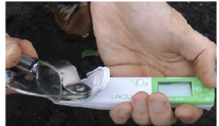
Figure 4: Placing sap directly onto LAQUAtwin nitrate sensor.