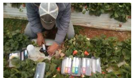
Figure 6: Irrigation water testing with LAQUAtwin pocket meters.