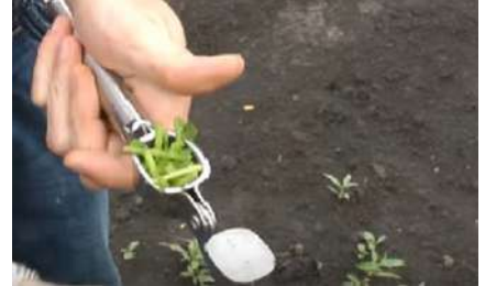
Figure 3: Loading of petioles into the chamber of garlic press for sap extraction.