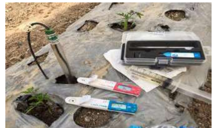
Figure 5: pH and conductivity testing on soil solution.